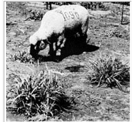
Figure 1. Low alkaloid varieties of reed canarygrass are clearly more palatable. In trials, livestock consistently choose the new varieties and graze them shorter than older varieties (such as is the ungrazed clump at the bottom center of photo).

Alkaloids are bitter, complex, nitrogen containing compounds which can reduce the performance of grazing animals. Animal performance may be highly negatively correlated with total alkaloid concentration, however, the two types of alkaloids in reed canarygrass have been documented to affect grazing animals somewhat differently. High concentrations of simple gramine alkaloids reduce palatability. The more complex tryptamine-carboline alkaloids cause diarrhea as well as reduce palatability.