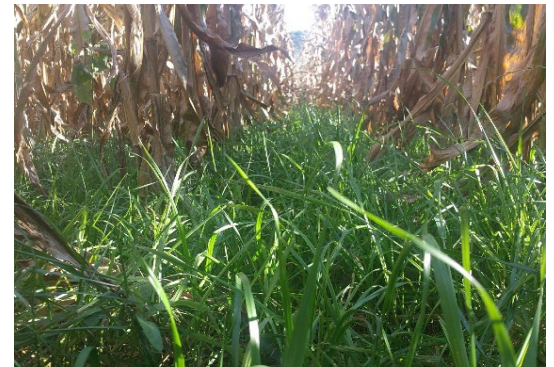
Left: Interseeder™ drilling seed and applying nitrogen and herbicide between corn rows. Right: Interseeded annual ryegrass growth after corn harvest.